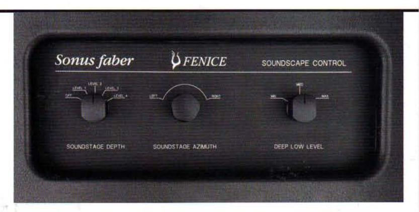
ABOVE: Sound Field Shaping is adjusted by - in addition to rear sub-speaker orientation - twin rotary controls labelled soundstage depth and soundstage azimuth, the former adjusting output level. A third control adjusts subwoofer level

acoustic space of a concert hall was rendered with truly lifelike scale. Given adequate space in which to 'disappear' they sound sensational.